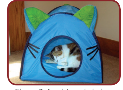
Figure 7. A quiet, secluded resting place

Therefore, cats need places in the house where they can "rest in peace," especially if there are cats of different ages in the environment ( Figure 7 ).