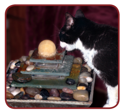
Figure 4. Cat drinking from a small fountain