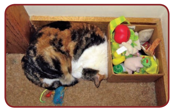
Figure 5. A "toy box" filled with a variety of cat toys