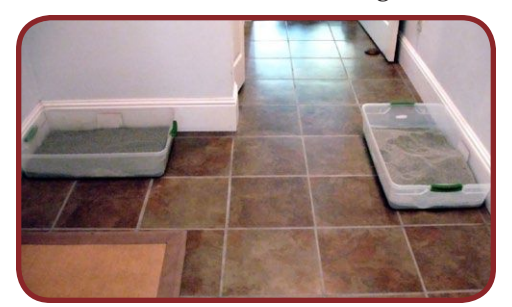
Figure 6. Litter boxes created from large, under-the-bed storage boxes

the standard scoopable variety—but each cat may have its own preference.<sup>5</sup>