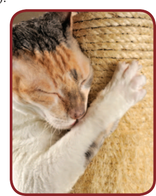
Figure 8. A well-used scratching post