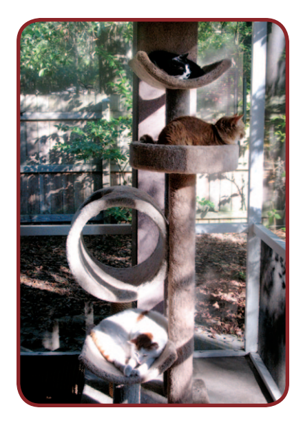
Figure 2. Cats enjoying the vertical space created by a cat condo